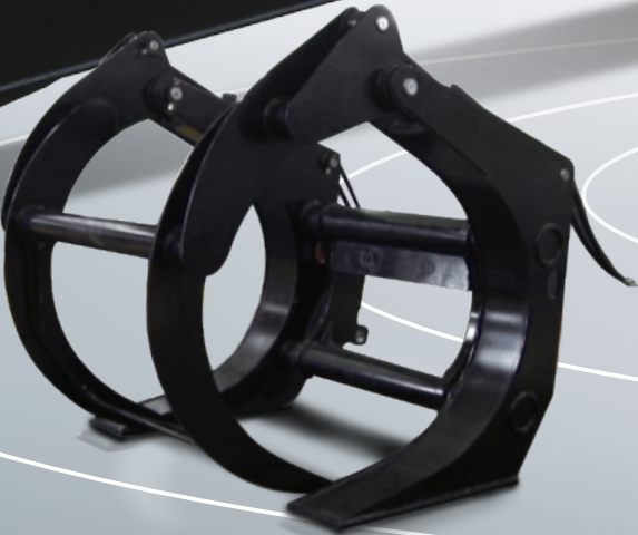
LOG & LUMBER GRAPPLE